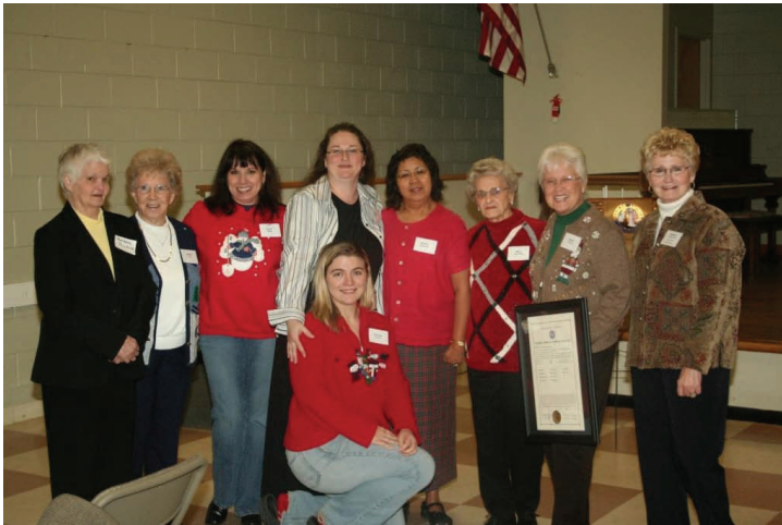
Photo from the December 3, 2007 Initiation Ceremony

My 2008 New Year Resolution is to find opportunities in our local communities for the new Auxiliary members to display their knowledge, skills, and American spirit while fund raising and working toward the betterment of wounded and disabled veterans and their families. During our first Auxiliary Unit meeting on January 7, 2008 we established building blocks of devotion, helpfulness and comradeship which will enable us to succeed at our goals.