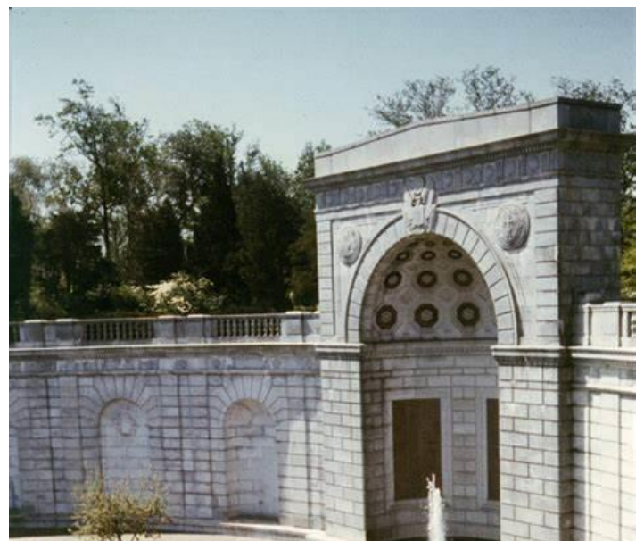
Top Left : Department members preparing to meet with Congressional Representatives at Midwinter Conference Top Right : Vietnam Veterans Memorial Bottom left: DAV members appear before House & Senate Veterans Affairs Committees Bottom right : Women Veterans Memorial