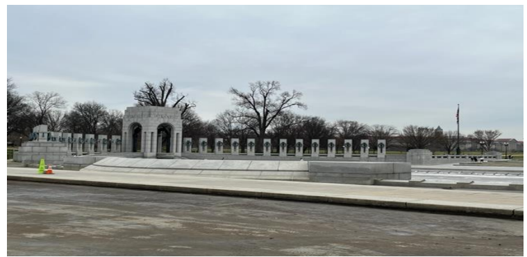
World War II Memorial above and Korean War Memorial below