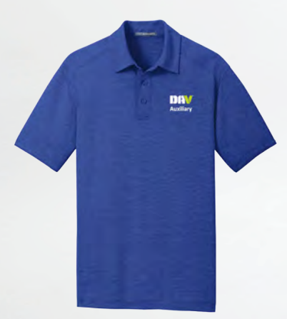
Men's Digi Heather Polo #DAVA0705 S-4XL | $25