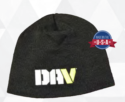
BLACK SOLID KNIT BEANIE #DAV0194 | $10