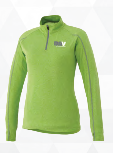
LADIES' 1/4 ZIP Green #DAV0200 Ladies' S-2XL | $30