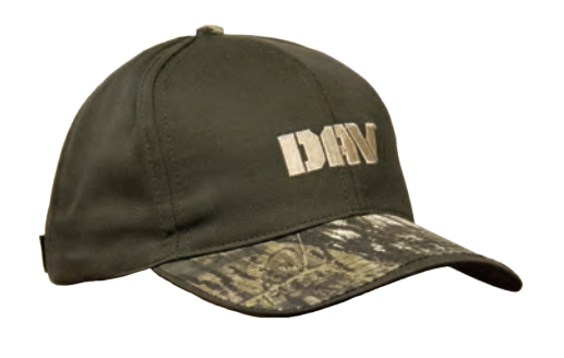
Camo/Olive Twill Hat Closeout $15 #DAV0040