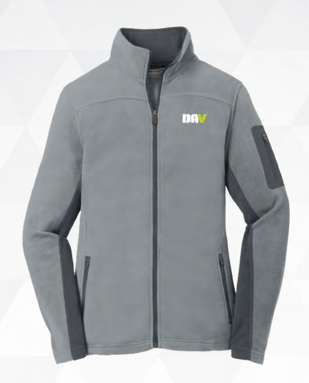
Grey | Limited Quantities #DAV0176 Ladies' XS-4XL | $35