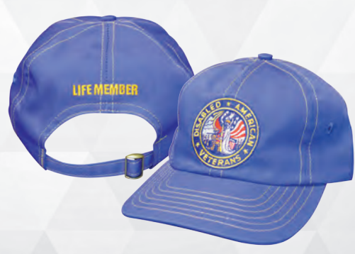
USA MADE LIFE MEMBER SEAL HAT