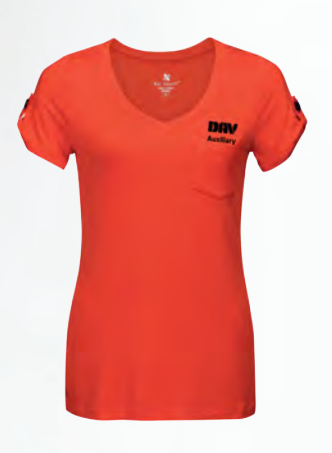
Ladies' Grenadine V-Neck #DAVA0702 L, 3XL-4XL | $25

Rust/White Men's #DAVA0704 | S-4XL | $40 Ladies' #DAVA0708 | S-3XL | $40