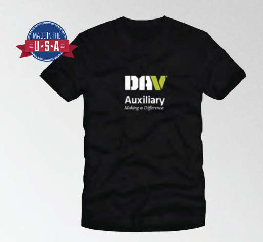
Classic Auxiliary Logo Tee #DAVA0699 S-4XL | $20