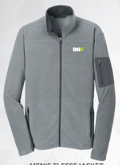
MEN'S FLEECE JACKET Grey | Limited Quantities #DAV0175 Men's S-4XL | $35