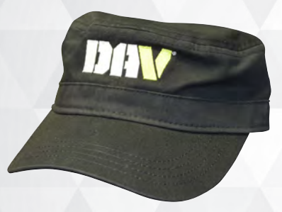
MILITARY CAP Black #DAV0158 | $15