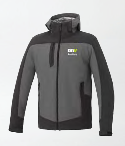
Unisex Jacket Grey Storm/Black #DAVA0709 S-4XL | $89