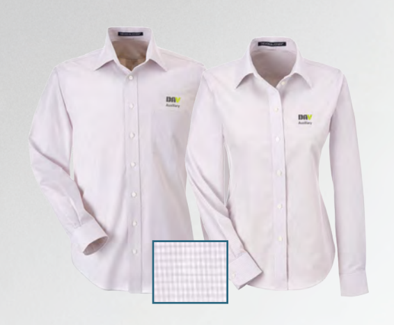
Men's & Ladies' Tattersall Dress Shirt

Rust/White Men's #DAVA0704 | S-4XL | $40 Ladies' #DAVA0708 | S-3XL | $40