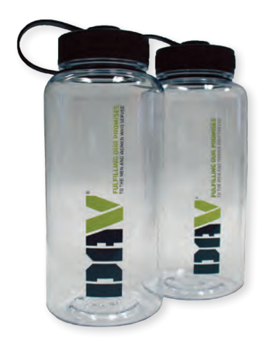
Water Bottle Closeout $6 #DAV0084