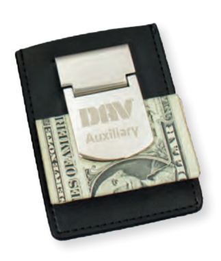
Auxiliary Money Clip Closeout $20 #DAVA0681