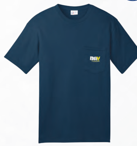
ALL-AMERICAN POCKET TEE