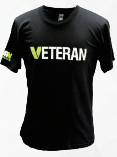
OSCAR MIKE SHORT SLEEVE BLACK TEE