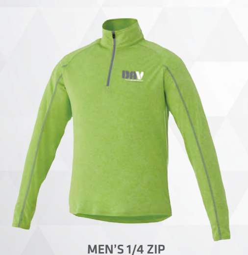
Green #DAV0201 Men's S-4XL | $30