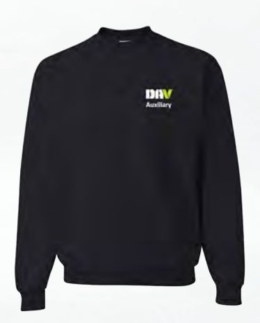
Crewneck Sweatshirt #DAVA0710 S-4XL | $20