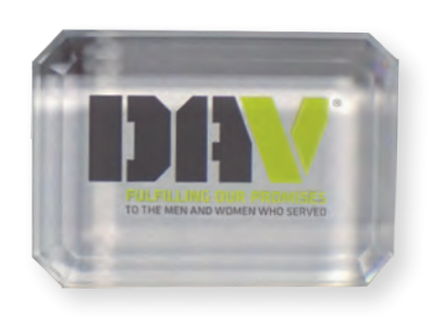
Crystal Paperweight Closeout $40 #DAV0098