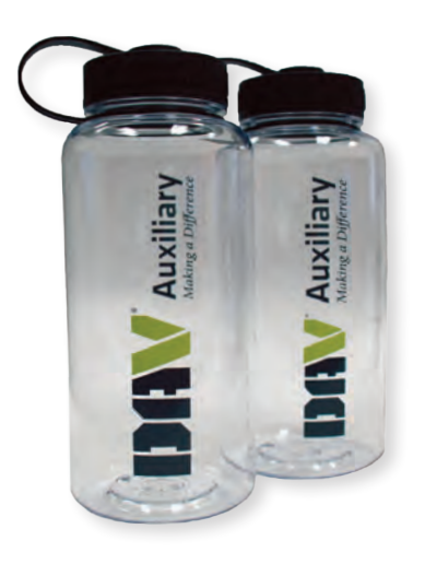
Auxiliary Water Bottle Closeout $6 #DAVA0685