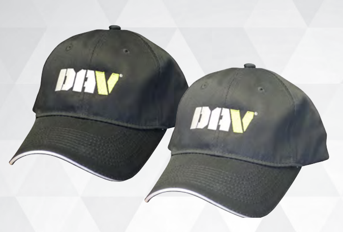
SANDWICH BILL Grey or Black #DAV0157 | $10