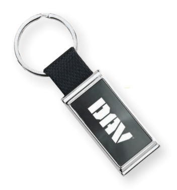
Keychain Closeout $3 #DAV0087