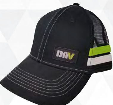
BLACK MESH HAT