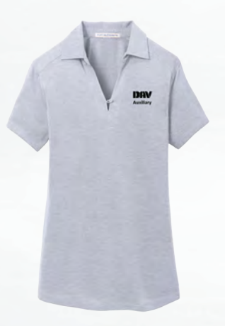
Ladies' Digi Heather Polo #DAVA0708 XS-4XL | $25