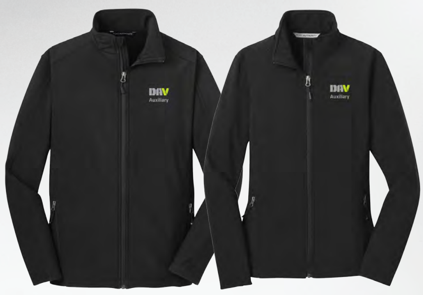
Men's Soft Shell Jacket Auxiliary S Only | #DAVA0697 Regular Price $35 Closeout $30

Ladies' Soft Shell Jacket Auxiliary XL-3XL | #DAVA0701 Regular Price $35 Closeout $30