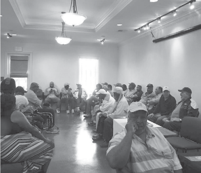
Veterans in New Orleans applying for disaster relief assistance