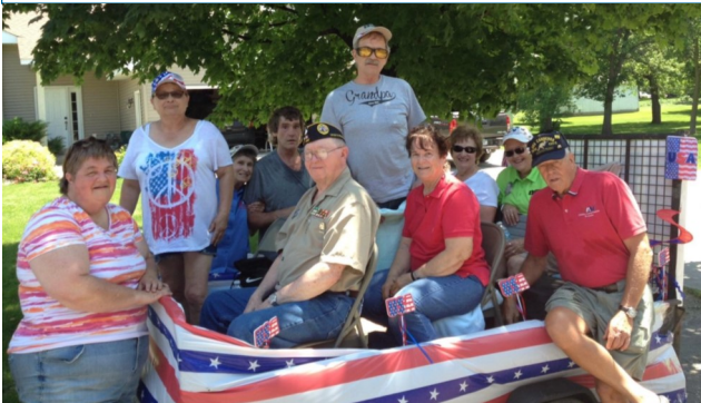
Chapter and Unit members ready to get the fun started at the Janesville Hay Daze Parade on June 19th. It was a Hot day with plenty of sunshine, but there was a breeze to keep everyone cool.