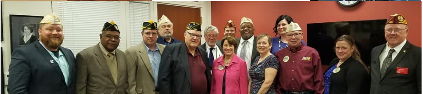
DAV MN Department and Chapter members at Dirkson Senate Office Building during National Mid-Winter Conference. Quote from Facebook Disabled American Veterans, Department of Minnesota page post: "Great meeting with Sen. Amy Klobuchar to discuss expanding caregiver support, proper funding and replacing CHOICE." Above. More Vets on the Hill photos. Below.