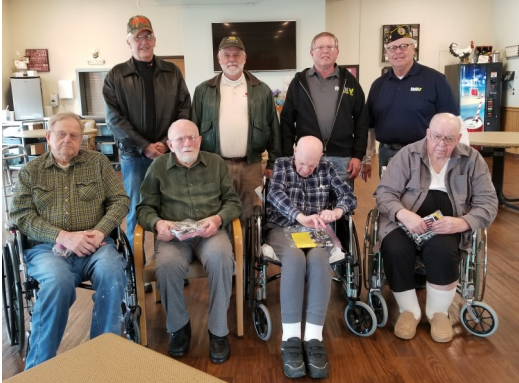
DAV Chapter 10 members visiting Veterans at Le Center Nursing Home, delivering pillow cases of their branch of service they served, to them in appreciation for their service in US Military. (Top Left and Right) DAV Chapter 10 members with Janesville Nursing home veteran residents. (Left) Presenting Le Center Nursing Home Veteran Resident with Pillow Case and Thank You card. (Right)