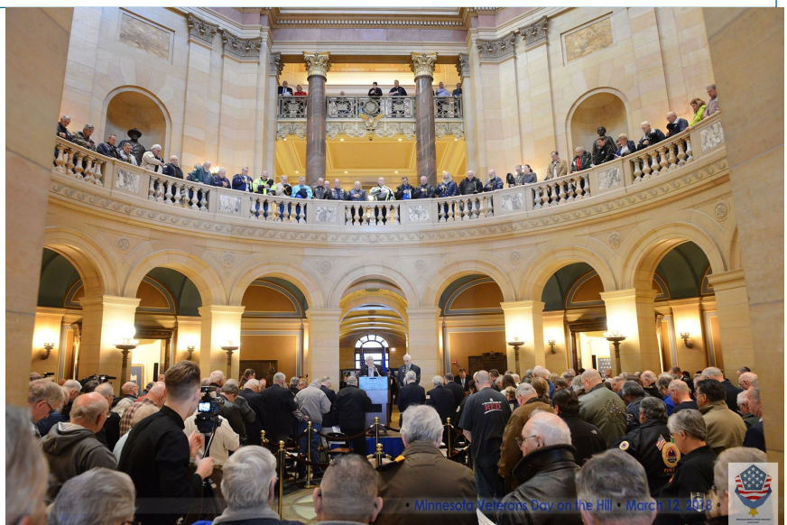
MINNESOTA VETERANS DAY ON THE HILL March 12 2018, put on by the Commanders Task Force, United Veterans Legislative Council and MACVSO. Rally in the State Capitol Rotunda.