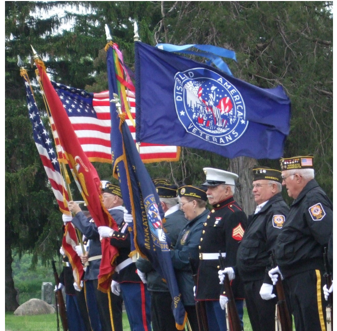
Honor Guards getting ready - Memorial Day 2013 - At Pilgrims Rest Cemetery, north of Mankato. Check your local newspaper to get this year's times and locations to honor our veterans.

Jun 12 - Executive Committee Meeting 5:00pm, Dinner 6:00pm, Regular Monthly Meeting 7:00pm Jun 14 Army Birthday and U.S. Flag Day Jun 14 DAV MN Foundation Golf Classic Jun 27 - National PTSD Awareness Day. For more details about future events call any officer or come to the meetings.