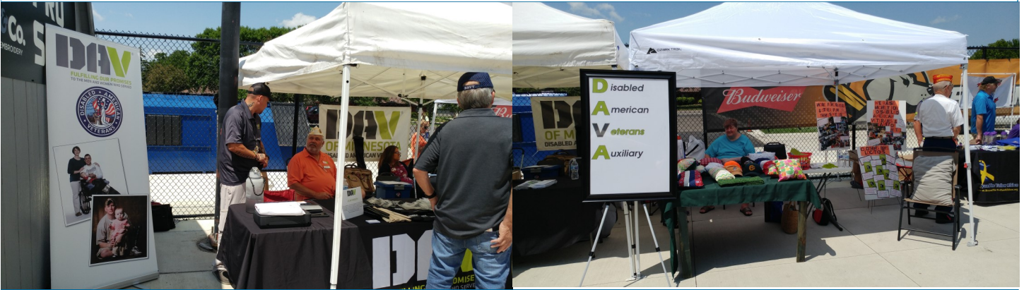
Aug 6th: A&W National Root Beer Float Day with donations to DAV encouraged. Sep 3rd: Forget-Me-Not Drive.