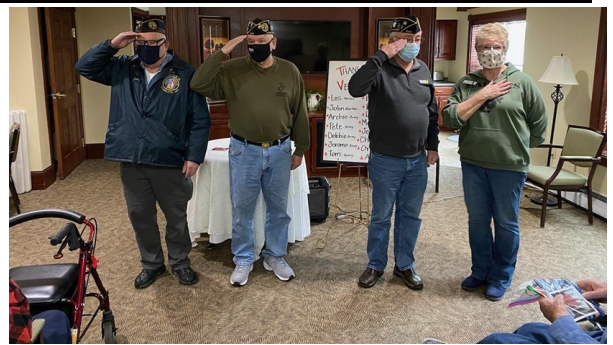
Pillowcase Committee members presenting Thank you cards and pillowcases to Veterans at local nursing homes.