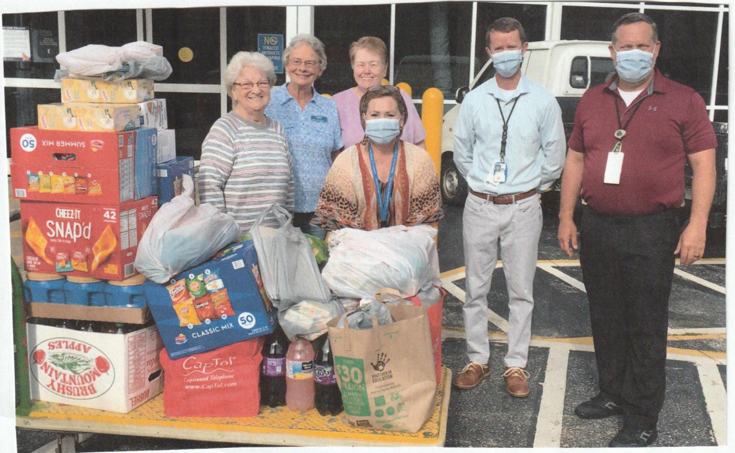
Members delivering items To V.A. Hospital in Asheville!