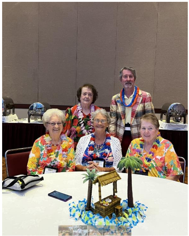
DAV Conference 2022 Greensboro NC