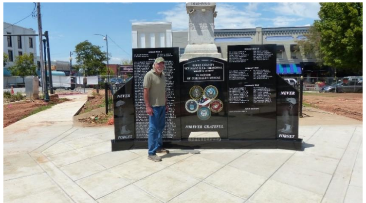
This is the Burke County KIA Memorial new

This is the old chapter building. We put up flagpoles just over a year ago, they look spectacular when waving in the breeze. We have the American Flag centered on a 35' pole, the NC State flag and the National POW flag are on 30' poles besides our National Flag.