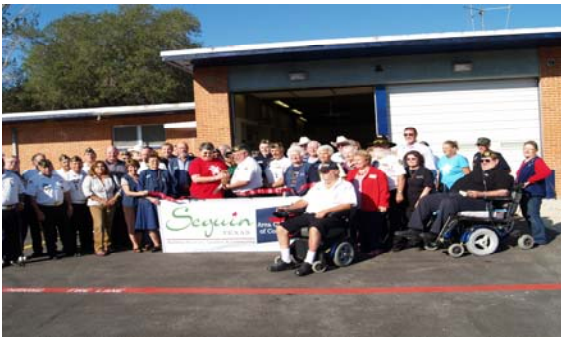
STAND UP FOR VETERANS, and may God Bless America

benefits and other resources available to them, all at no cost to them.