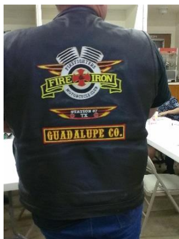
Fire & Iron