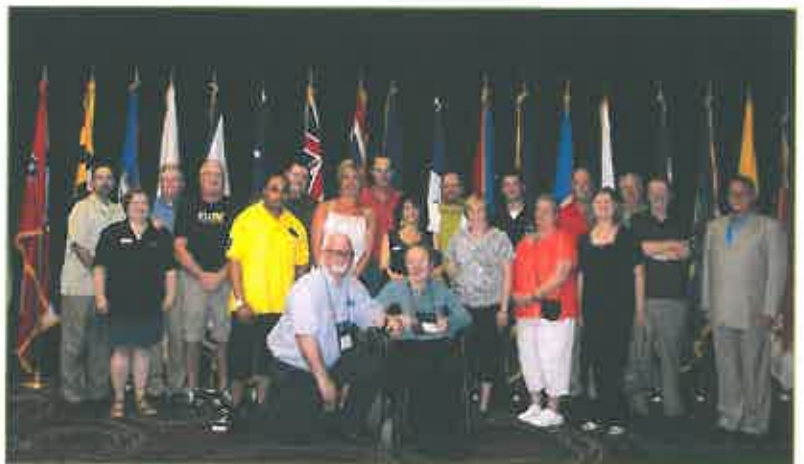
2012 National Convention in Las Vegas. Pictured are Department and National Service office staff, along with other Michigan members.

Thank you to all who participated, volunteered or just came out for dinner and the raffle. Everybody had a great time and we already have a list of golfers who want to come back next year.