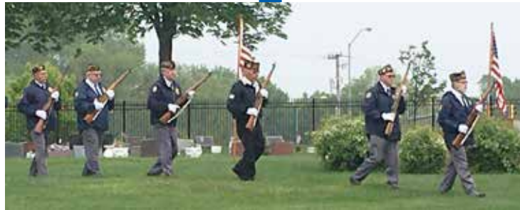
Memorial Parade through four cemeteries in Sioux Falls.