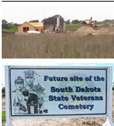
At right and below are some photo shots on construction progress at the South Dakota State Veterans Cemetery. Administrative building and committal shelter walls are going up!